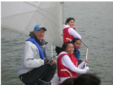
BLUE WATER SAIL 2006

NEXT MEETING APRIL 10, 2018 6pm to 8 pm...and ALWAYS OVER BY EIGHT, FOOD AND DRINK SERVED, 12 TH FLOOR, 155 MONTGOMERY, SF, TWO BLOCKS FROM BART