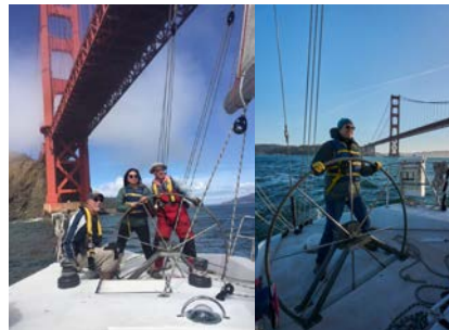
BLUE WATER SAIL 2018

You can make a difference if you want to. Up to you. We've been at this for thirty years and tens of thousands of children from school kids to incarcerated kids...Showing them the wind and the wonder.