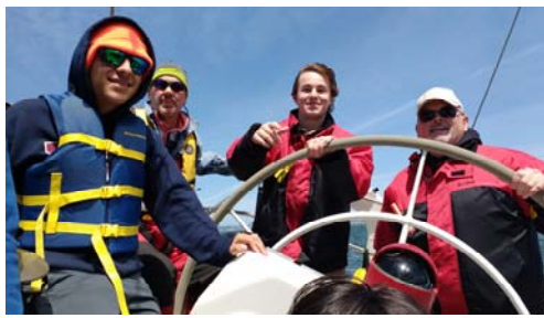
BLUE WATER SAIL 2017

You can make a difference if you want to. Up to you. Join us.