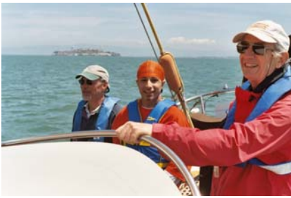
BLUE WATER SAIL 2005