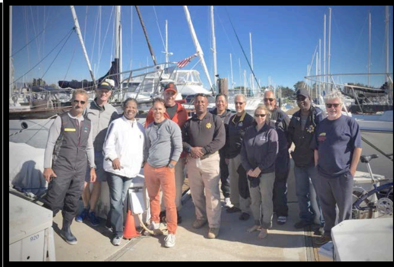
PROBATION DEPARTMENT CHIEF'S SAIL