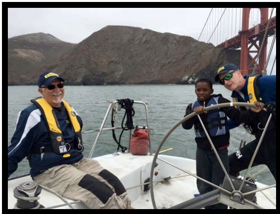
COMMUNITY SAILS ON GOLDEN BEAR