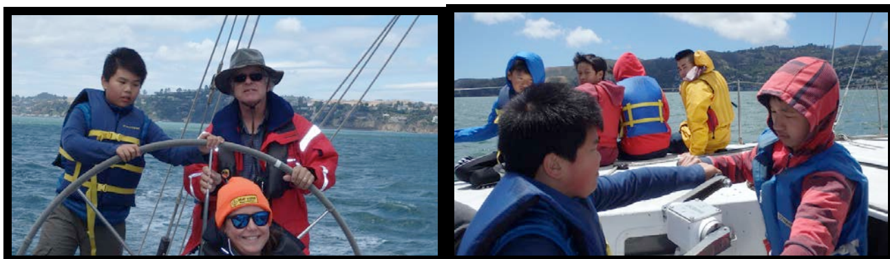
COMMUNITY SAILS ON GOLDEN BEAR

NOTE THAT GOLDEN BEAR WILL BE MOVING TO ANOTHER SLIP IN THE SAME MARINA IN THE NEXT TEN DAYS AND BLUE WATER WILL BE PREPARING AND SIGNING AN AGREEMENT WITH THE MARINA AS TO BERTHING. THE BERTH IS STILL GRATIS TO BLUE WATER FOUNDATION DUE TO OUR LONG SERVICE TO THE CHILDREN OF SAN FRANCISCO.