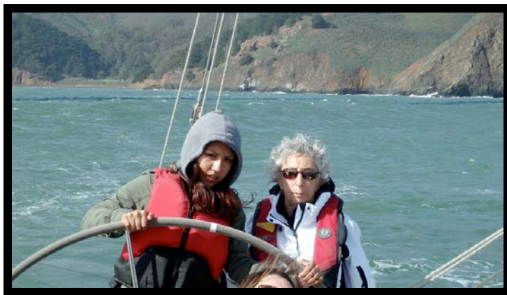
SF DISTRICT SAILS ON GOLDEN BEAR

EXPLORATION SAILS PROGRAM: THE SF SCHOOL DISTRICT THURSDAY SAILS-EVERY PUBLIC SCHOOL IN SF: OUR OLDEST AND MOST WIDELY USED SERVICE TO THE STUDENTS OF SAN FRANCISCO-Three hour trips on SF Bay with the students getting a chance at