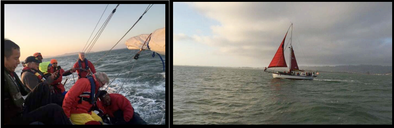
NIGHT SAIL WITH OCEAN GATE STUDENTS IN HIGH WIND

Recall we also are providing sails for El Dorado County probation department. El Dorado probation wants monthly sails...our next sail will be in September, stay tuned for details, on Fernweh, meeting in Richmond.