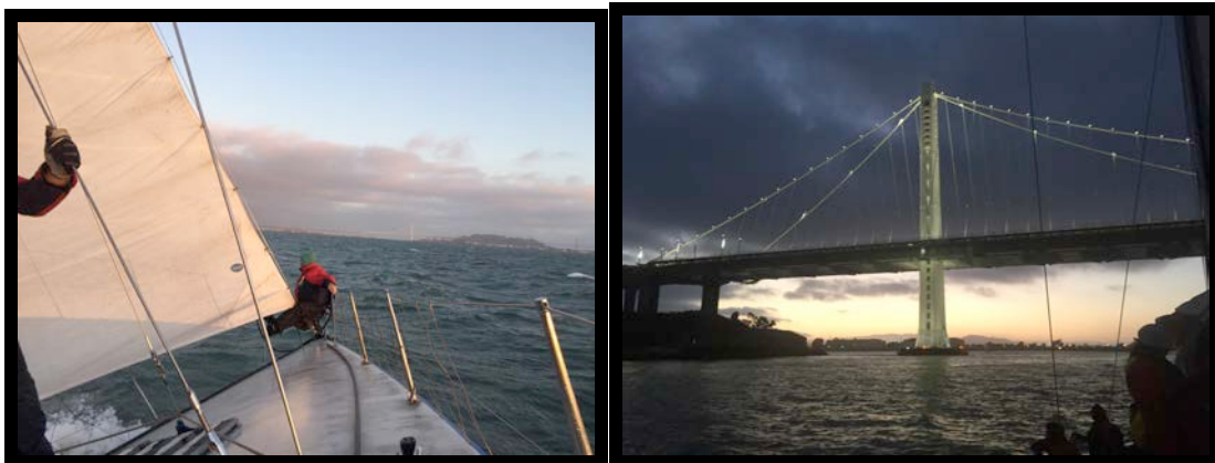
GOLDEN BEAR ON NIGHT SAIL WITH OCEAN GATE