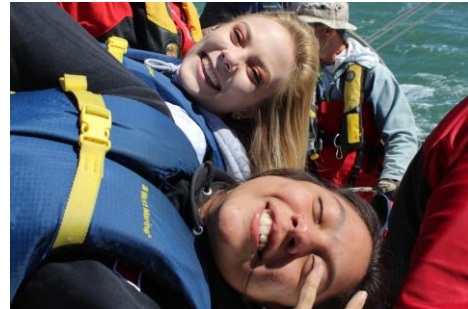
BLUE WATER SAIL 2019

You can make a difference if you want to. Up to you. Join us. www.bluewaterfoundation.org .