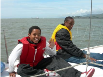
BLUE WATER SAIL 2009

NEXT MEETING OCTOBER 8, 2019 6pm to 8 pm...and ALWAYS OVER BY EIGHT, FOOD AND DRINK SERVED, 2 TH FLOOR, 48 GOLD STREET, SF, FIVE BLOCKS FROM BART, IN JACKSON SQUARE, all welcome or call in on our toll-free conference line, 605 475 4120, ACCESS CODE 1142034#.