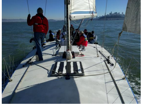
BLUE WATER SAIL 2019