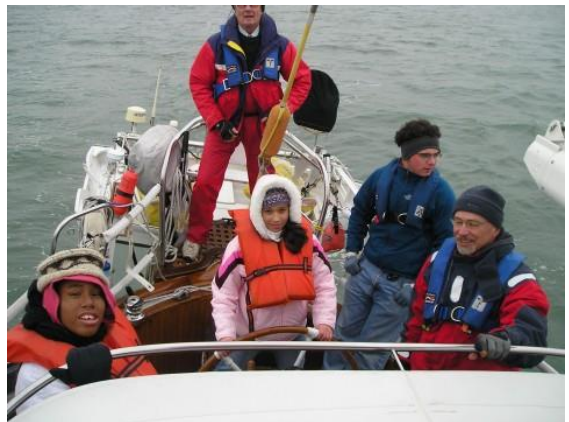
BLUE WATER SAIL 2004