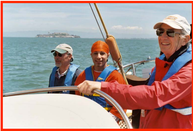
BLUE WATER SAIL 2005